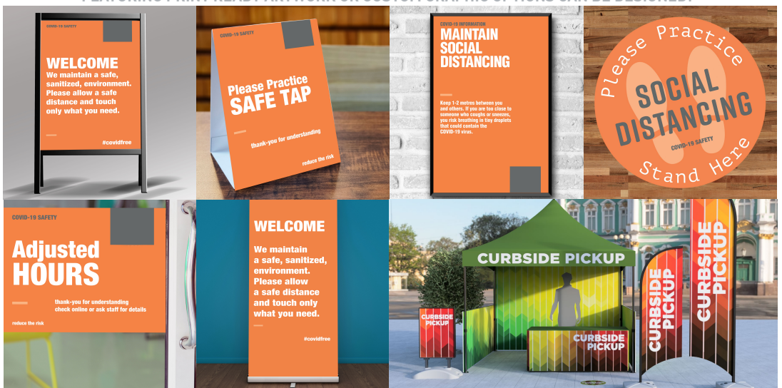
SANDWICH BOARD | POSTERS / CARDS | TENT CARDS | FLOOR DECALS | WINDOW CLING BANNERS | QUALITY OUTDOOR PRODUCTS

FEATURING PRINT READY ARTWORK OR CUSTOM GRAPHIC OPTIONS CAN BE DESIGNED!